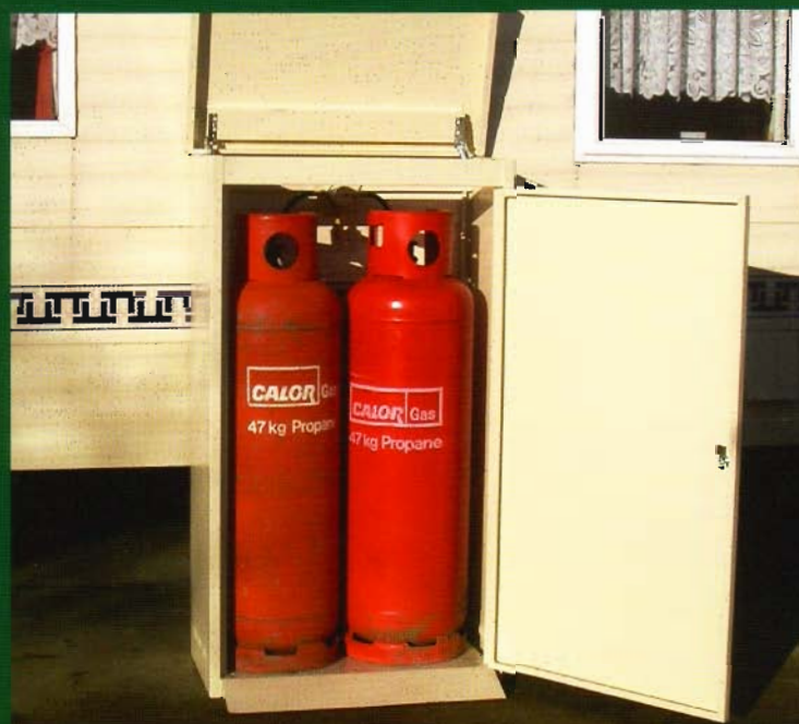
Asgas (four x 47kg storage unit also available)